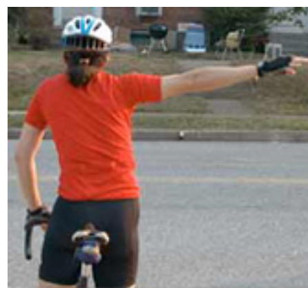
Also means right turn

Now that you've learned those hand signals, we'd like to give you a big thumbs-up for finding out more about bike safety!